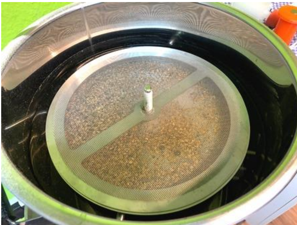
Place the fine sieve on top.