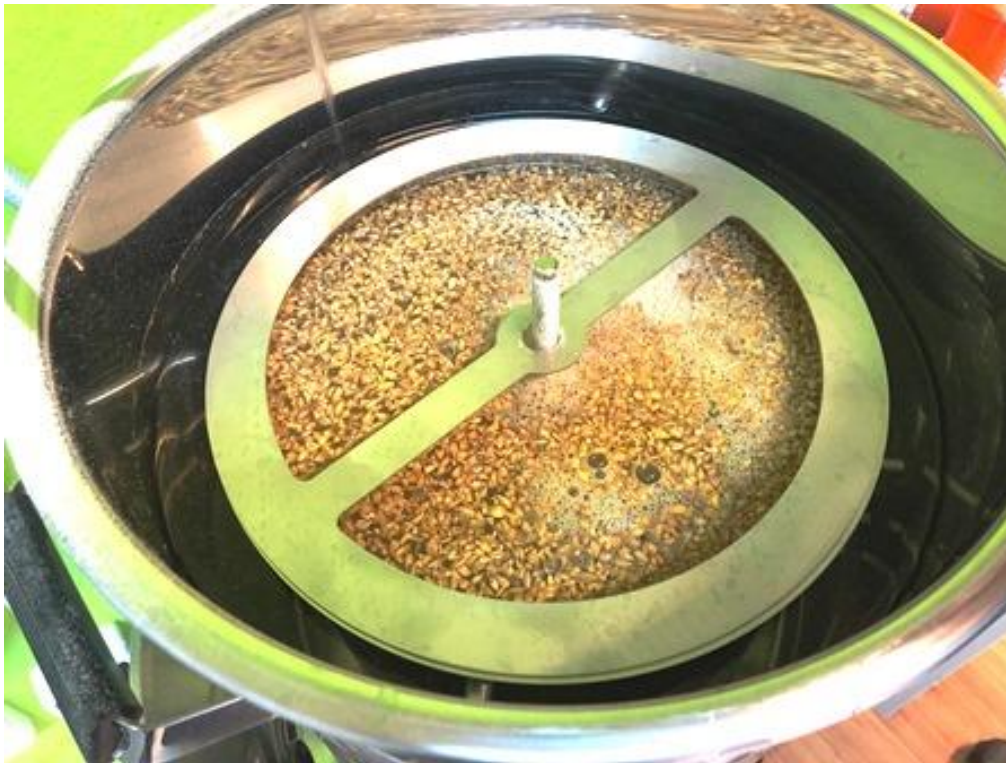
Place the spacer ring on the edge of the malt tube.